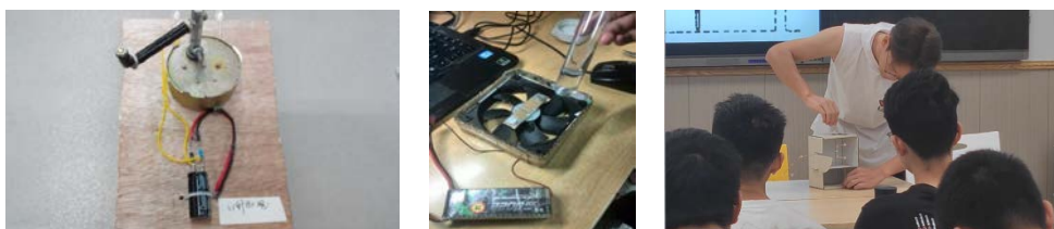
Figure 4 Students' extracurricular design works

In the extracurricular design activities, students work in teams, actively think, persevere, dare to innovate, and design a series of innovative works.