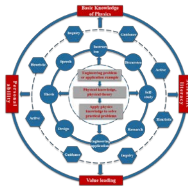
Figure 1 Course objectives